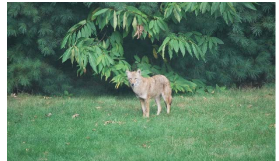
Coyote in back yard in Greenville, R.I.

Not all coyotes have bad habits or create problems. A coyote walking down the street during the early morning or walking along the back edge of your lawn next to the adjacent woodlot is not necessarily stalking you or your children. Coyotes have been part of Rhode Island's fauna for more than fifty years and are an important natural resource and component of the ecosystem. All indications are that they will continue to be part of our fauna for a long time to come. As proven in the West, campaigns to eradicate coyotes, though sometimes effective at lowering population levels for a short term, are expensive and have generally proven unsuccessful in the long term. The coyote's reproductive capacity and ability to disperse into new areas ensures that unoccupied habitats will not remain so for long.