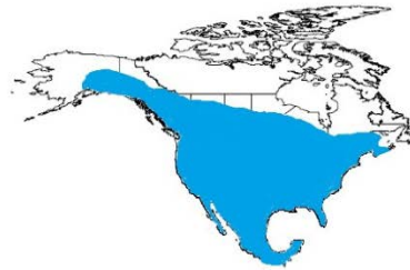
Figure 2. Approximate distribution of coyote in 1990 North America

coyotes in New York State were documented in the 1920s. By the 1930's, coyotes had been documented in Maine, and in the 1940s Vermont (1942) and New Hampshire (1944). They were first reported in Massachusetts in 1957 and in Connecticut in 1958. As it states in the 1962 edition of "The Mammals of Rhode Island" by John Cronan and Albert Brooks "The coyote has never occurred in Rhode Island but its range has been extending steadily eastward in recent years and at some future date it might be seen in Rhode Island." In 1966 there were two reports of coyotes being killed by automobiles, one in North Smithfield and one in Cranston. In 1969, a coyote was shot in the Touisset section of Warren. Within the next several years coyotes began to appear in other communities such as Warwick, Smithfield, South Kingstown, and North Kingstown. Today, coyotes can be found in all Rhode Island communities except Block Island.