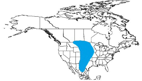
Figure 1. Probable distribution of coyote in North America prior to European settlement

Historic range and current range: At the time Europeans first established settlements in North America, the coyote's range was likely restricted to the prairie regions of North America west of the Mississippi River from southwestern Canada to central Mexico. The dominant canine predator in Northeastern North America at that time was the gray wolf ( Canis lupus ), some now question whether this was/is a separate species. Throughout the 18th and 19th centuries European settlement expanded westward, and the extensive eastern forests were cleared for agriculture and timber products. A network of linear travel corridors was created as roads, bridges, and railway systems were constructed. In addition to the unprecedented alteration of habitat, there was direct persecution of large predators such as the wolves and mountain lions that had previously competed for food resources with coyotes. Through habitat loss and unregulated hunting, populations of white-tailed deer, the primary prey of wolves and mountain lions, were also decimated.